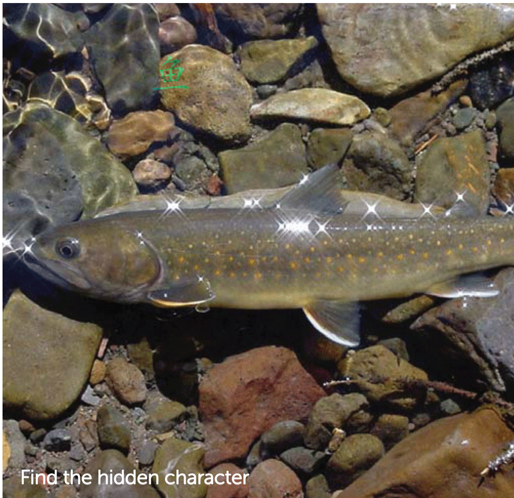
Find the hidden character