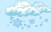
It is snowing.