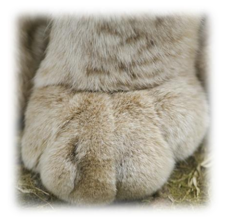
Why do you think the European lynx has large hairy paws?

The European lynx has very large paws compared to the size of its body. These paws are also very hairy.