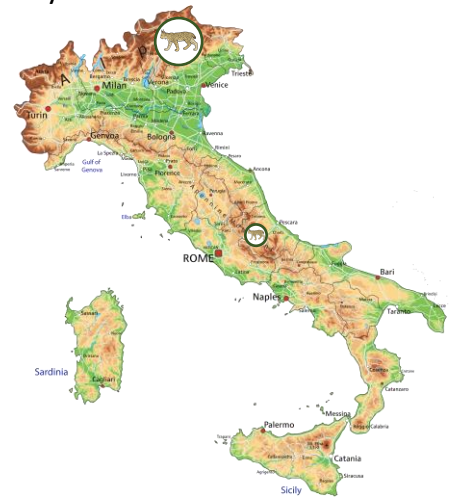
Name the two Italian mountain ranges where the European lynx has been found.

The European lynx has been found in the north east mountain areas of Italy. There also might be a small population in central Italy.