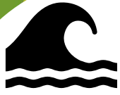
Rivers & wetlands