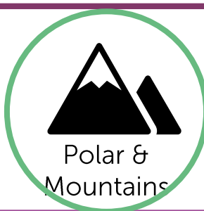
Polar & Mountains