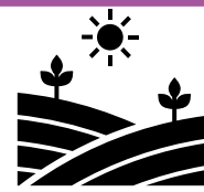
Grasslands & Steppes