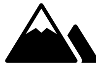
Polar & Mountains