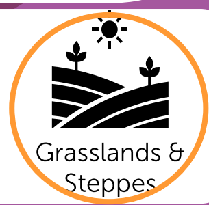
Grasslands & Steppes