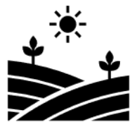
Grasslands & Steppe