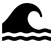
Rivers & Wetlands