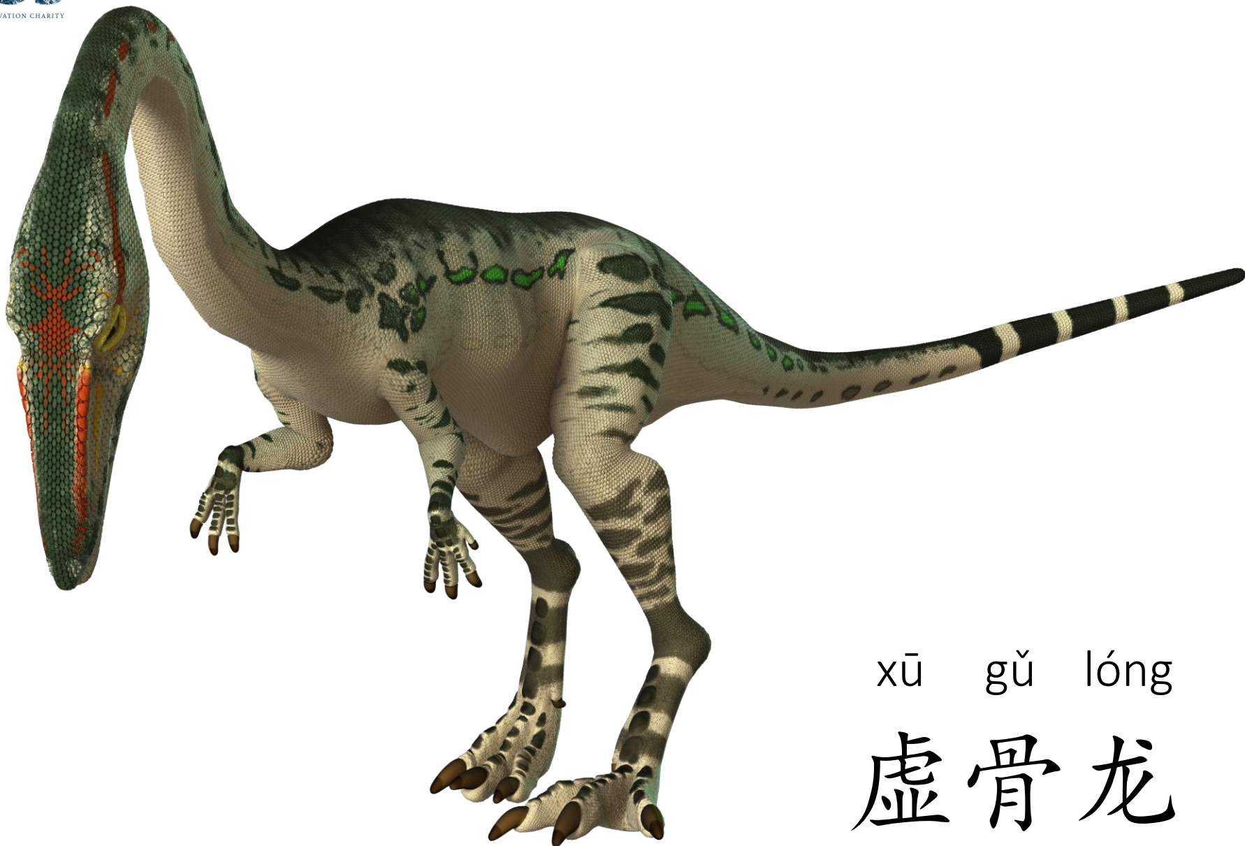
xū gǔ lóng 虚骨龙