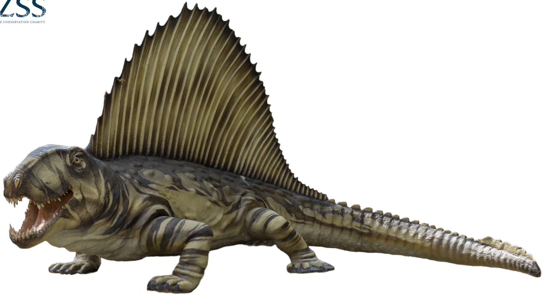
yì chǐ lóng 异齿龙