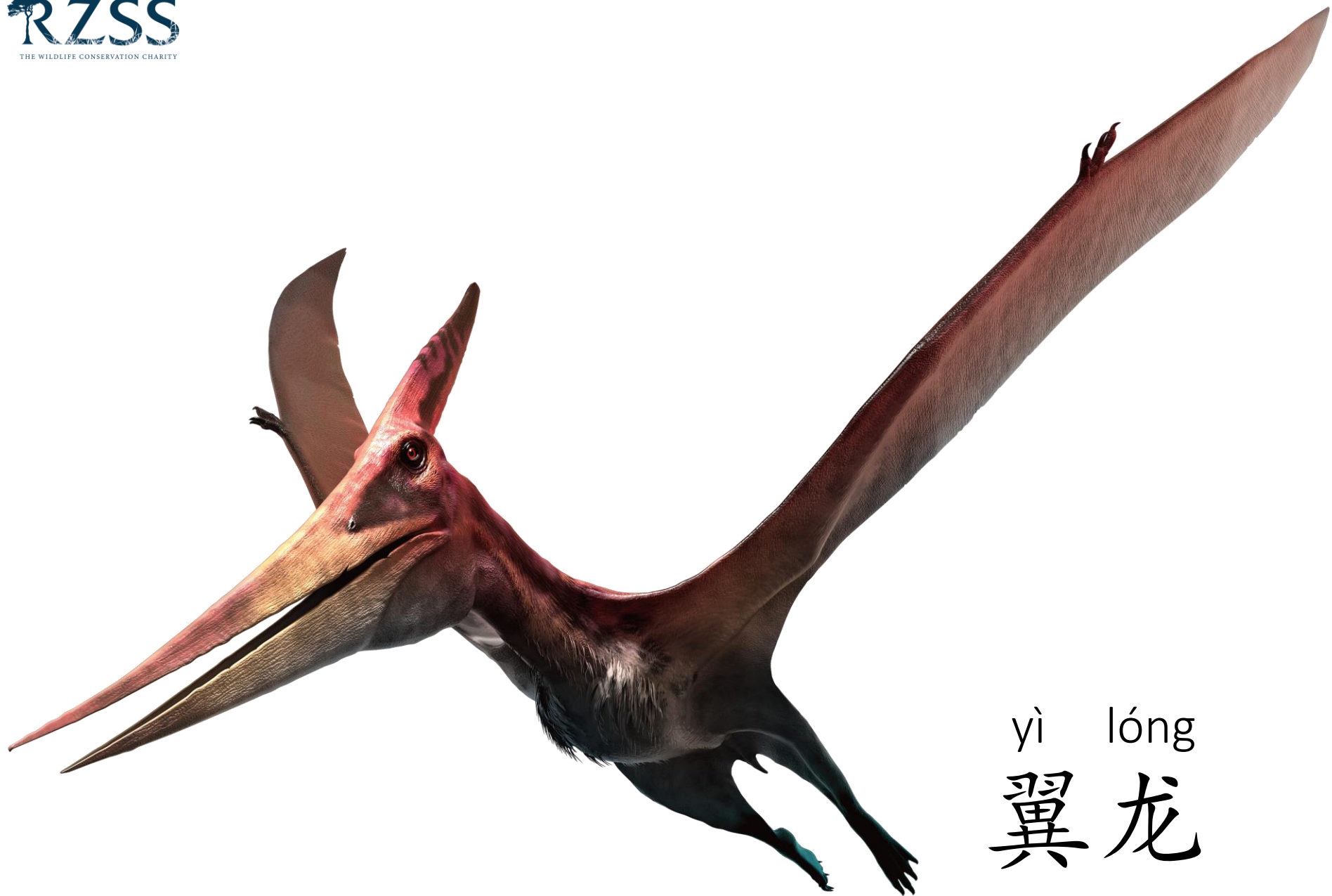
yì lóng 翼龙