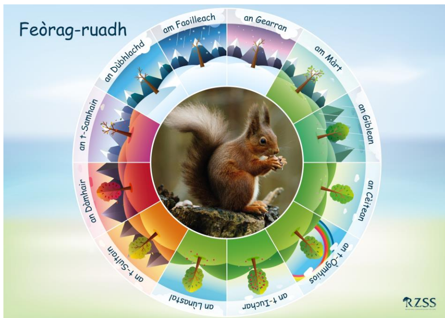
base board – months in Gaelic

Shuffle the red squirrel sector cards. Place them on a table with the red squirrel picture facing up. Each player, in turn, takes one of the cards. Read the card and match to the correct month which is written in Gaelic on the board. Completed board gives a picture of the squirrel's life.