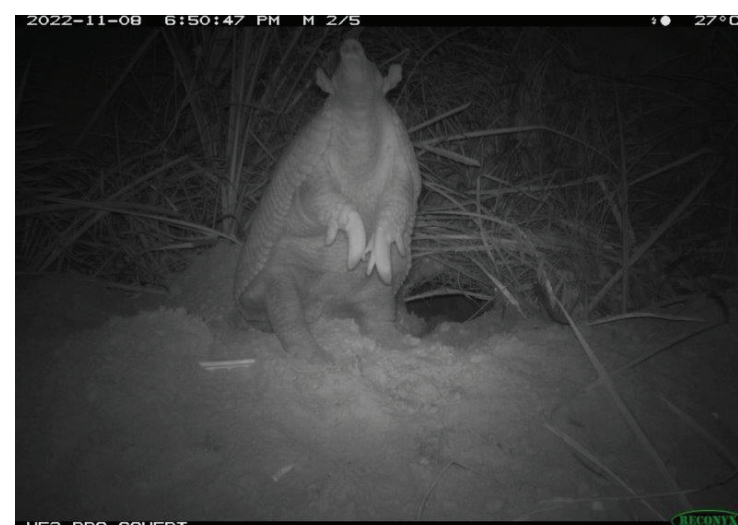
The giant armadillos come out at night so most of the photos are from camera traps.

Their back paws are used for digging into the sand to make their burrows.