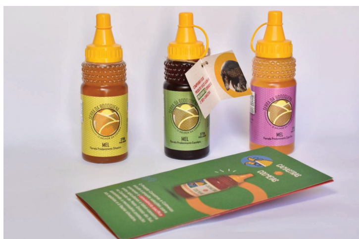
These labels are in Portuguese because the idea was first introduced in Brazil.

The beekeepers will then get a certificate and can put a label on their honey saying 'giant armadillo friendly honey'.