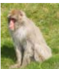
Cornuje (alpha male)

Fumio is 2 years old. He is Angara's second eldest son. He follows his older brother Daiki. Both the boys are becoming very independent from their mother.